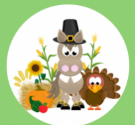
FURRY FRIENDSGIVING November 18 10:00am-11:30am

REGISTER FOR UPCOMING EVENTS AT HESTOVINSTABLES.ORG