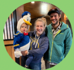
HORSE AND TREAT October 28, 11:00am-12:30pm